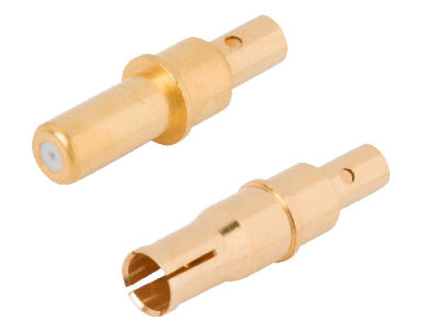
AS39029 Size 8, 12 Contacts Cost effective, DC 3 GHz

SV Microwave has a full portfolio of Size 8, 12, 16, and 20 D38999 RF contacts in several different styles for various applications, including MIL-SPEC and spring-loaded high-frequency options.