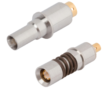
BMZ Size 8 Contacts Ideal for higher voltage applications