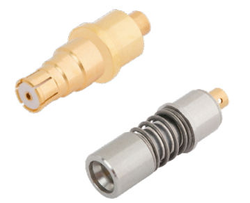
BMB Size 8 Contacts Aligned to the latest SOSA Specification