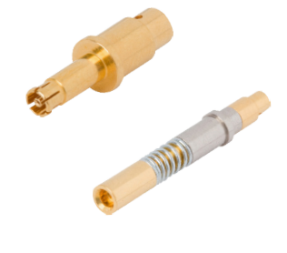
SMPS Size 16 Contacts Spring-loaded contact performs to 65 GHz